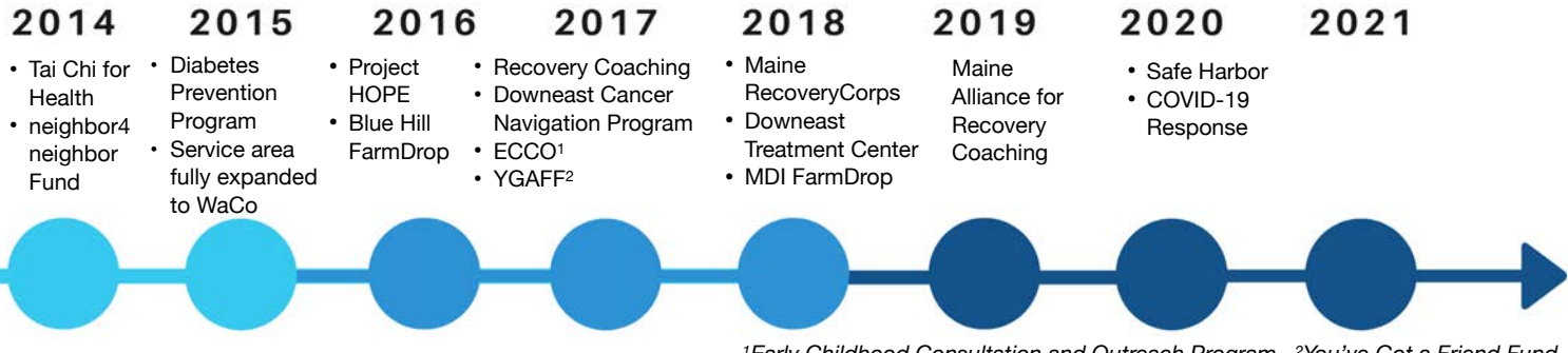
<sup>1</sup>Early Childhood Consultation and Outreach Program <sup>2</sup>You've Got a Friend Fund

In 2016, together with Ellsworth Police Department, we launched Project HOPE to help connect people seeking recovery from substance use disorder to treatment and other resources. We continued to expand our recovery and prevention programming, convening the Washington County Substance Use Response Collaborative. We took on operations of BlueHill FarmDrop together with Fairwinds Florist, with strong support from Blue Hill Wine Shop, the developers of the innovative online farmers' market.