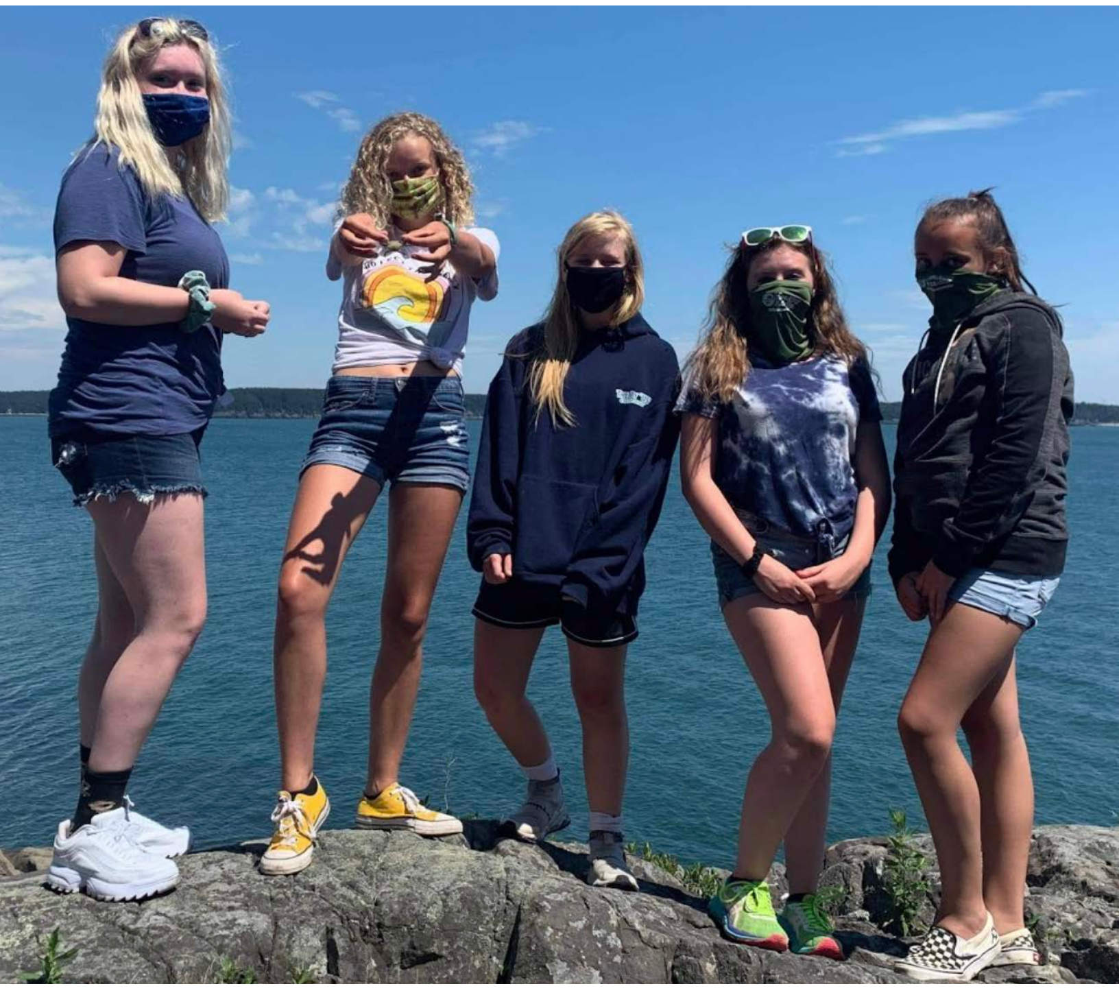
Local teens engaged in DownEast Teen Leadership Camp , July, 2020.